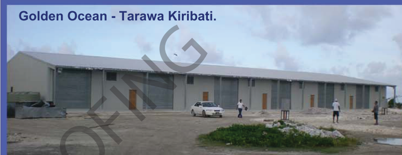
Golden Ocean - Tarawa Kiribati.