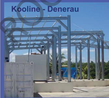
Kooline - Denerau