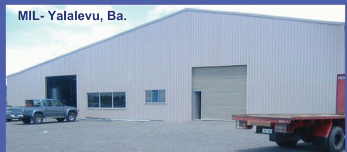
MIL - Yalalevu, Ba.